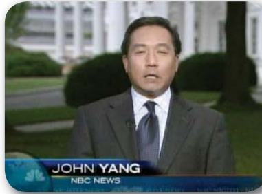
On June 24, NBC's John Yang deliberately cut and pasted remarks by Pat Buchanan about illegal immigration to tar Buchanan, as well as Rush Limbaugh and Newt Gingrich, as xenophobic propagandists.