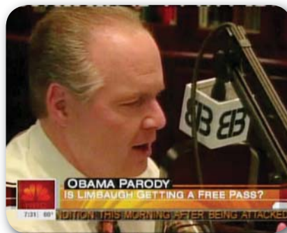
NBC's May 21 Today show distorted the facts and relied on a far-left-wing activist's spin to try to smear Rush Limbaugh as a racist.

How You Can Help the MRC Fight Liberal Media Bias