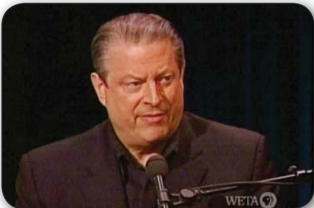
On July 7, NBC donated 75 hours of free coverage to Al Gore's Live Earth concerts, which spread Gore's global warming propaganda worldwide.

NBC Universal donated 75 hours of coverage to Al Gore's Live Earth concerts — essentially 75 hours of global warming propaganda — on seven of its various stations on July 7. During NBC's primetime coverage, Gore told Dateline anchor Ann Curry, "Thanks for what NBC has been doing," for these concerts are "the largest global entertainment event in all of history." NBC's Curry then pressed Gore to run for president, fawning, "without you there will not be the political will in the White House to fight global warming.