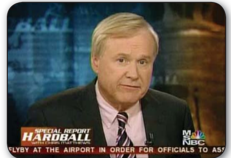
MSNBC's Chris Matthews sandbagged Ann Coulter with a pre-planned call-in harangue by Elizabeth Edwards, which led to further Edwards exposure on ABC, CBS and NBC.

After Elizabeth Edwards, wife of liberal Democratic candidate John Edwards, phoned into MSNBC's Hardball on July 3 and attacked Ann Coulter for "hate" speech — and completely distorted Coulter's actual comments — the morning network news shows gave Mrs. Edwards more time to slam and lie about Coulter on July 5.