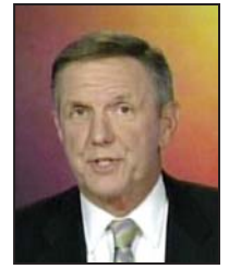
ABC’s Charles Gibson gave much coverage to a court ruling against the Bush Administration last year but completely ignored a July 2007 reversal of that ruling by another court.

Typical was ABC World News anchor Charles Gibson, who lectured in August, “A federal judge tells the Bush administration one of its main terror-fighting tools violates the Constitution.” Yet after the recent July 6 ruling, Gibson said nothing, ABC said nothing, and CBS said nothing. At NBC, Lester Holt reported on the court ruling, noting that the plaintiffs in the case “couldn’t prove they were spied upon.” All the while, an on-screen graphic behind Holt read: “Domestic Spying.”