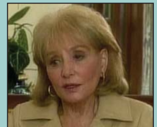
ABC’s Barbara Walters praises Michael Moore’s socialist schlock, “ SICKO ,” and urges people to “see it.”