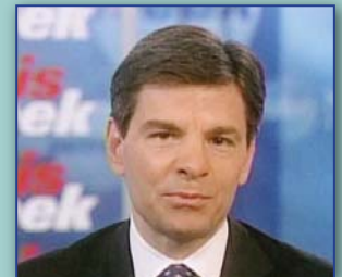
On This Week , ABC's George Stephanopoulos suggested that Americans who don't vote for Barack Obama are racists.