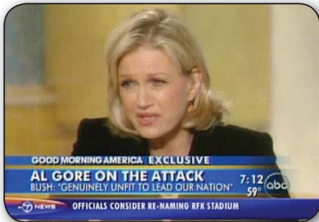
On the May 8 Good Morning America , ABC's Diane Sawyer falsely reported that the U.S. stock market today mirrors that of 1929.

In 2000-2007, the Dow rose from 10,577 to 13,312 — an average annual increase of 3.7 percent. In the seven