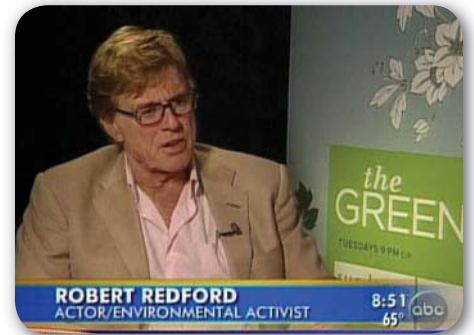
The leftist environmental views of actor/activist Robert Redford were praised and promoted on the May 2 Good Morning America .