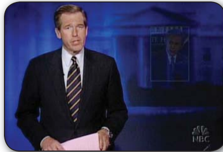
NBC Nightly News anchor Brian Williams skewed a poll on May 11 to misrepresent Americans' views on abortion.

While ABC can't get its economic news right, NBC's Brian Williams flubbed big time on the abortion issue on the May 11 Nightly News , falsely claiming that "most Americans believe a woman has a right to an