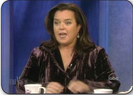
On the May 1 edition of The View , ABC's Rosie O'Donnell trashed the quality of America's service men and women.

While scheduled to leave ABC's The View in mid-June, co-host Rosie O'Donnell has not let up in her liberal tirades. Case in point, on May 1, the fourth anniversary of President Bush's "mission accomplished" speech, O'Donnell railed, "How many more years and how many more dead kids?"