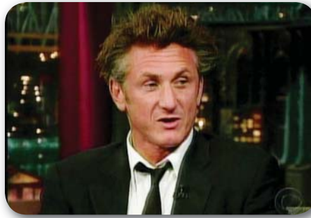
On Late Night with David Letterman , actor/activist Sean Penn said that Venezuela's socialist leader Hugo Chavez is a "fascinating guy" who helps the poor and supports free expression.