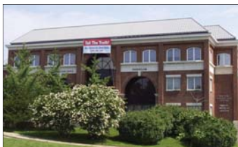
MRC Headquarters • Alexandria, Va