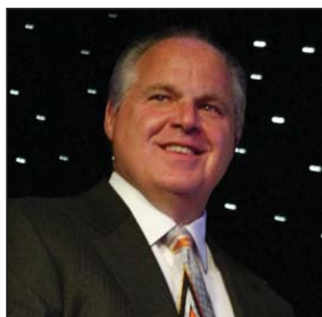
Liberal media and liberal congressmen took Rush Limbaugh's comments out of context and tried to smear him as unpatriotic.

Look at the Rush case. On Sept. 26, on his radio show, Rush was talking with a caller about the Iraq war and how