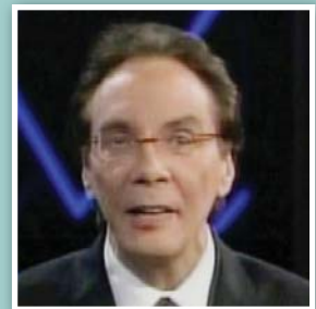
Fox's Alan Colmes lectures that Iran's leader, Mahmoud Ahmadinejad, is "a conservative" and "very right-wing."