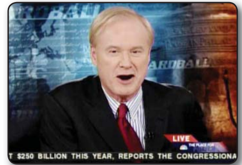
Chris Matthews on MSNBC's Hardball , with ratings in the cellar, lectures his audience that Rush Limbaugh, with 13 million listeners, "is irrelevant."

was ranked, again, the No. 1 talk radio host of the year by Talkers Magazine . Nonetheless, Matthews took a cheap swipe at Limbaugh after listening to a reporter comment that the New York Times's shoddy story on Sen. McCain and a lobbyist might push more conservatives to support McCain.