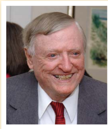
William F. Buckley Jr. (1925-2008)