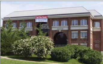
MRC Headquarters • Alexandria, Va