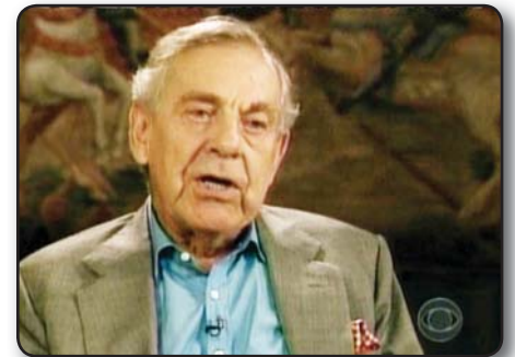
CBS's Morley Safer reports on 60 Minutes that Danes are the happiest people in the world because they have low expectations, unlike Americans.

CBS's 60 Minutes is obsessed with moving America more quickly down the path to socialism. This was clear again in a Feb. 17 segment, when reporter Morley Safer prattled endlessly about the happy Danes — Denmark ranks as the happiest country in the world. "What makes a Dane so happy?" quizzed Safer. "And why isn't he wallowing in misery and self-doubt like so many of the rest of us?"