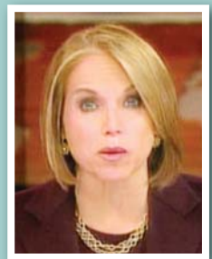
CBS Evening News anchor Katie Couric applauds Democrat John Edwards' liberalism as "big ideas."

ABC's Martha Raddatz reports on Bush's proposed 5% spending increase for health care: "The President's budget slashes billions of dollars in the growth of federal health care programs. Medicare and Medicaid would be cut by almost $200 billion." ■ MSNBC's Chris Matthews reveals his true feelings for Barack Obama: "I have to tell you, you know, it's part of reporting this case, this election, the feeling most people get when they hear Barack Obama's speech. My, I felt this thrill going up my leg. I mean, I don't have that too often." ■ Finally, actor Richard Belzer explains Iraq war spending to HBO's Bill Maher: "This is a big heist, this is a big heist. The right wing is in power, the bankers are screwing everyone — the oil companies, Halliburton — this is no f---ing mystery. It started with Reagan crushing the poor, crushing the unions ...."