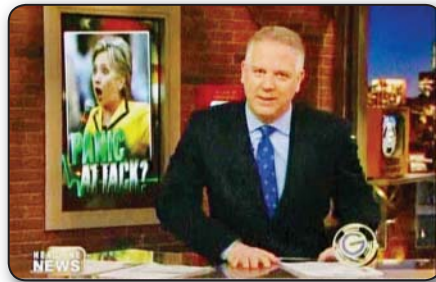
CNN's house-conservative Glenn Beck frequently cites MRC research on his Headline News program.