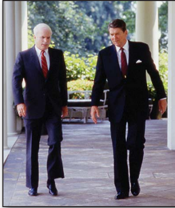
The Republican primary debate was dominated by one question: Who is the most qualified to carry the flag of Ronald Reagan?

Ironically, the man who survived this intramural scrum is the one who arguably least qualifies as a Reagan conservative. He claims to be a champion of freedom, but gave us McCain-Feingold, perhaps the greatest infringement ever on the First Amendment. He claims to be a champion of American sovereignty but gave us McCain-Kennedy, which is an amnesty no matter how much he denies it. He claims to be a champion of the unborn, but has waffled on this in the past, supporting federal funding of embryonic stem cell research, and winning the endorsement of Republicans for Choice. He