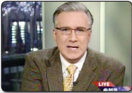
MSNBC's Keith Olbermann rails that President Bush is "a fascist," blending a "toxic" mix "of government and big business."

Still foaming, rhetorically, at the mouth, Olbermann slammed the president: "If you believe in the seamless mutuality of government and big business, come out and say it! There is a dictionary definition, one word that describes that toxic blend. You're a fascist! Get them to print you a T-shirt with fascist on it! What else is this but fascism?"