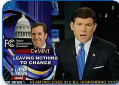
An MRC Business & Media Institute update on the Fairness Doctrine is cited on Fox's Special Report .