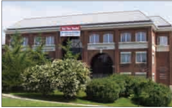
MRC Headquarters • Alexandria, Va