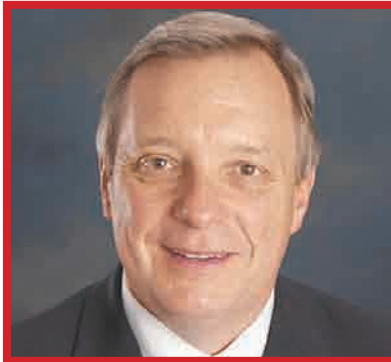
New "ownership" and "diversity" rules for broadcast media, introduced by Sen. Dick Durbin (D-Ill.), could muzzle conservative talk radio.