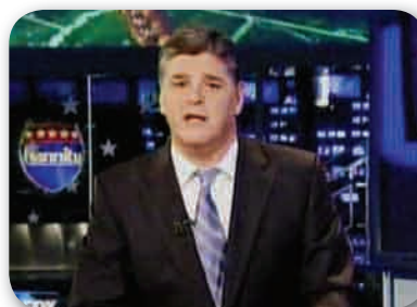
The MRC blog NewsBusters is cited in a story by Sean Hannity on his Fox program, Hannity's America .

WOND, Linwood, NJ, Feb. 19 KLPW, St. Louis, MO, Feb. 25 KSFO, San Francisco, CA, Feb. 20 KPDQ, Portland, OR, Feb. 19 WSMR, Sarasota, FL, Feb. 20 WMKT, Petoskey, MI, Feb. 24 WAMT, Orlando, FL, Feb. 13, 26 WDUN, Gainesville, GA, Feb. 26 KSSZ, Columbia, MO, Feb. 27 KBAR, Burley, ID, Feb. 11, 16, Mar. 2 KUIK, Hillsboro, OR, Feb. 26 WMAL, Washington, DC, Feb. 12 KDKA, Pittsburgh, PA, Feb. 11 WIBA, Madison, WI, Feb. 11, 16, 25, 27 KXYL, Brownwood, TX, Feb. 17 KCEO, San Diego, CA, Feb. 12 WIBC, Indianapolis, IN, Feb. 12 KSLR, San Antonio, TX, Feb. 10 WLW, Cincinnati, OH, Feb. 16 KERN, Bakersfield, CA, Feb. 12 ~ PARTIAL LISTING